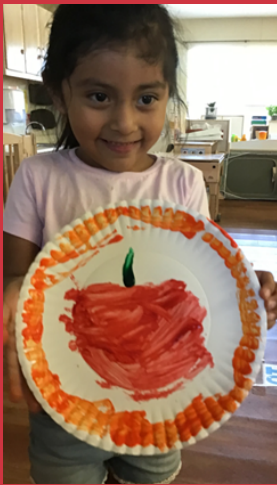
Creativity and Exploration